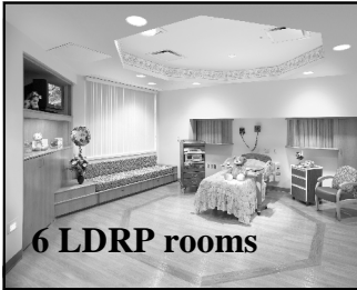
6 LDRP rooms

Bi-lingual in Spanish and English a plus